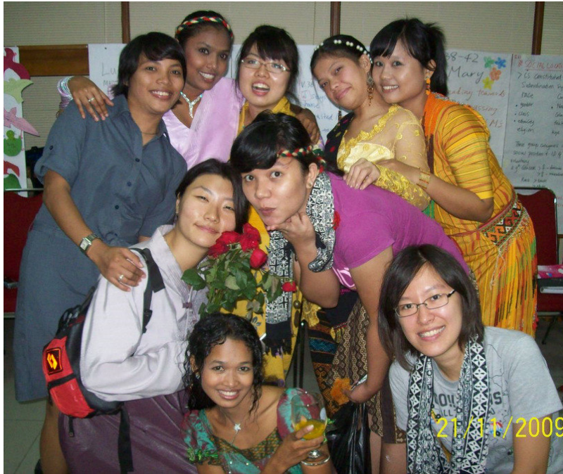
SCM Women in the WDT workshop 2009

(WSCF affirms and advocates gender justice within the Federation, Church and Society. It has been always an endeavor of WSCF to create an inclusive community where every one can experience a dignified life in abundance)